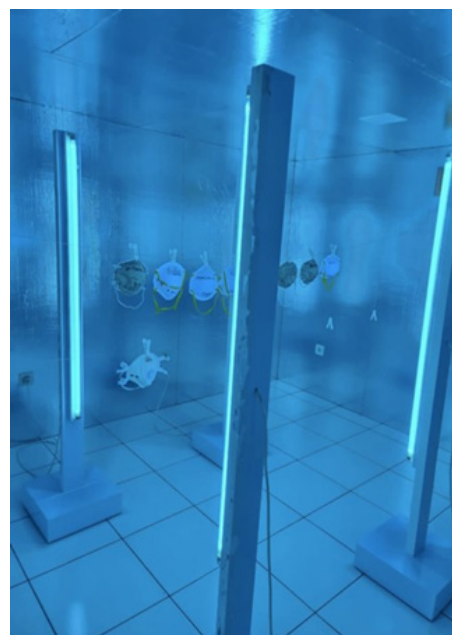
Figure 2. Disposable N95 respirator during disinfection process inside UVGI chamber

The measurement results at several points using a UV-C meter were summarized in Table 1. The radiation power measurements at D and E were 0.09 mW/cm 2 . These points had 0.04 points higher than A, B, and C, which were 0.05 mW/cm 2 . Measurements at the lower points of D and E were 0.03 mW/cm 2 , 0.06 points lower than the upper points. No radiation was measured in point F as the probe was placed against the light source